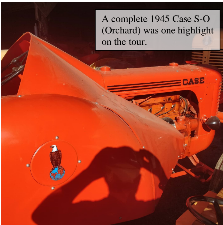
A complete 1945 Case S-O (Orchard) was one highlight on the tour.