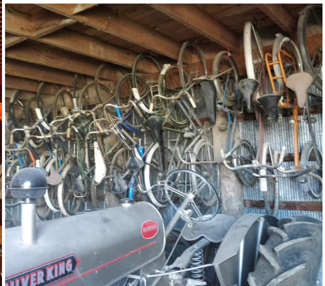
Bicycles of all shapes hung from the wall.