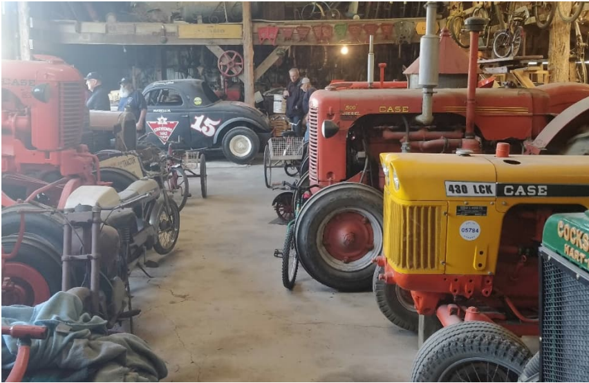
A small sample of the variety of artifacts on display.