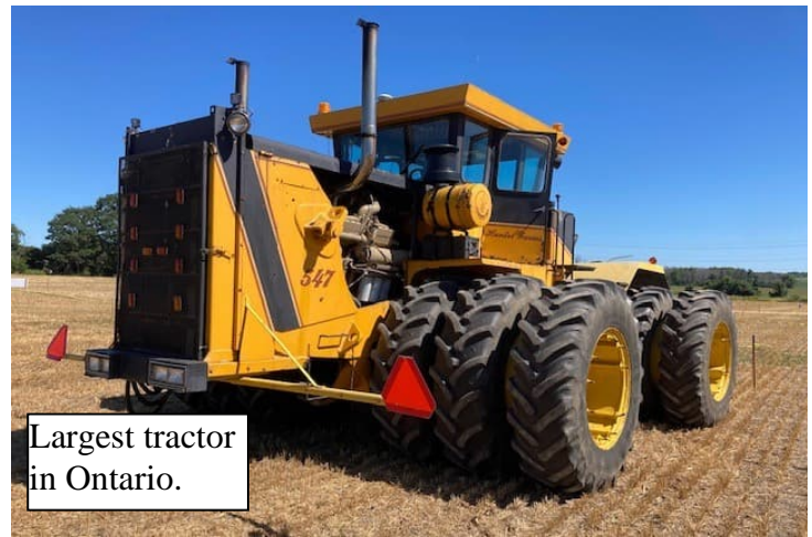
Largest tractor in Ontario.