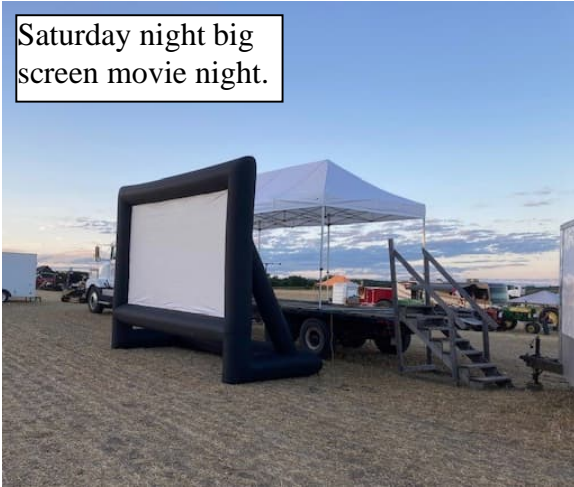
Saturday night big screen movie night.