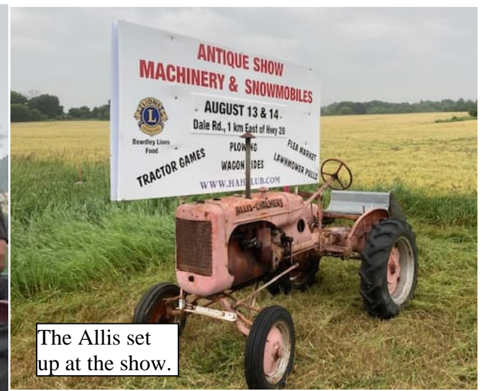
The Allis set up at the show.

Greg St. Amand driving the Allis Chalmers B to the show site for advertising the show.