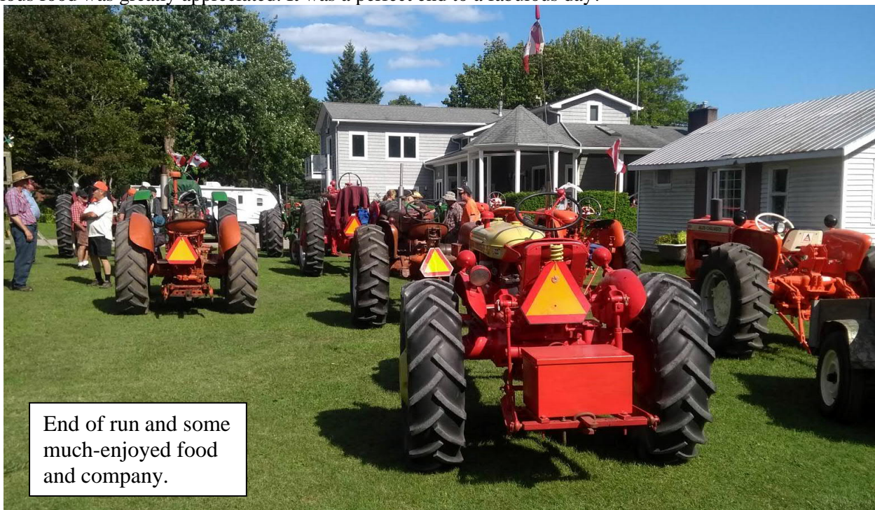
End of run and some much-enjoyed food and company.