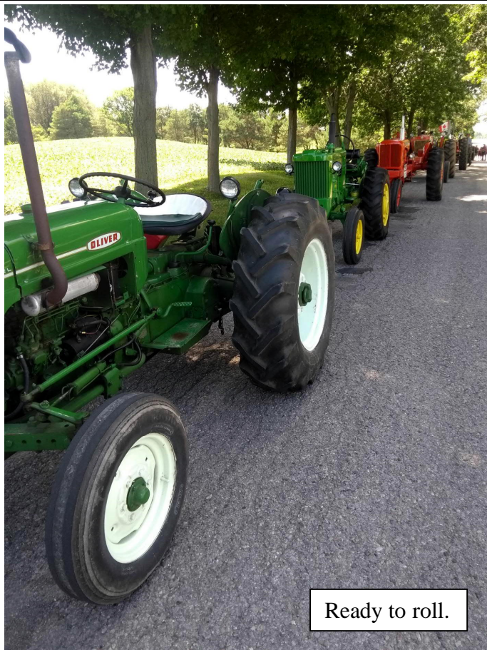
Ready to roll.